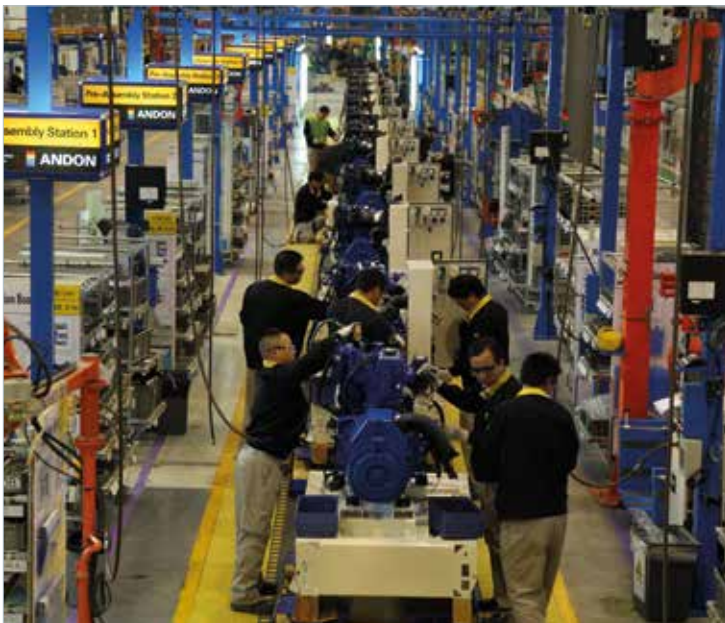
Production line, China.

With worldwide logistics that span the globe, and a distribution network of 370 Dealers in over 150 countries, we provide reliable power and ongoing support when and where you need it.