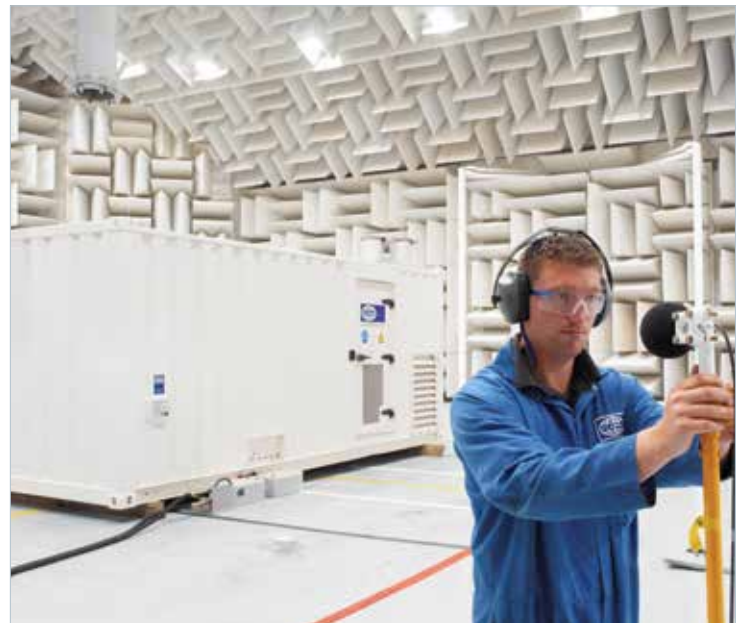
Engineering Centre of Excellence, Northern Ireland.