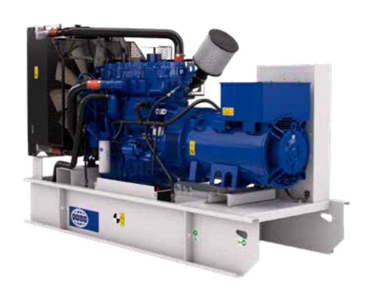
Designed for 8 hours running at full load in prime applications, the compact base frame provides drag and lifting points as standard, aiding transportation and installation.