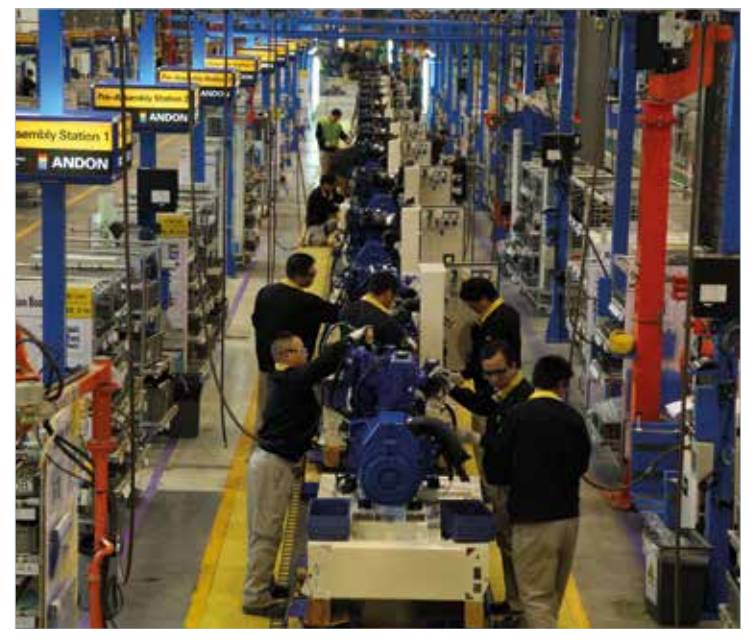
Production line, China.

With worldwide logistics that span the globe, and a distribution network of 370 Dealers in over 150 countries, we provide reliable power and ongoing support when and where you need it.