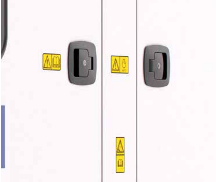
Side hinged doors, on each side of the enclosure, provide ample access to all necessary components during installation and servicing. Lift-off hinges enable the doors to be removed at an angle of 90°, facilitating easy servicing in confined installation spaces.