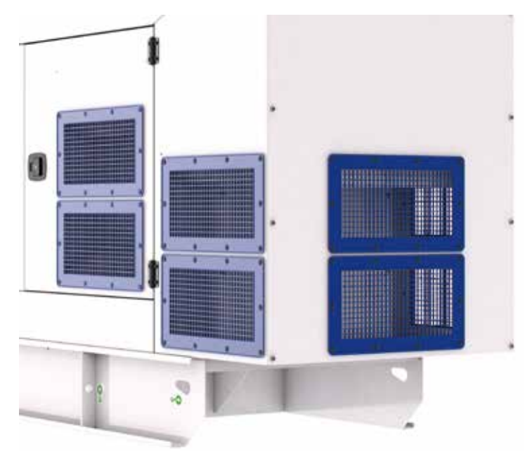
Unique modular air handing units, manufactured from a highgrade composite material, optimum corrosion resistance whilst contributing to a reduction in noise output.