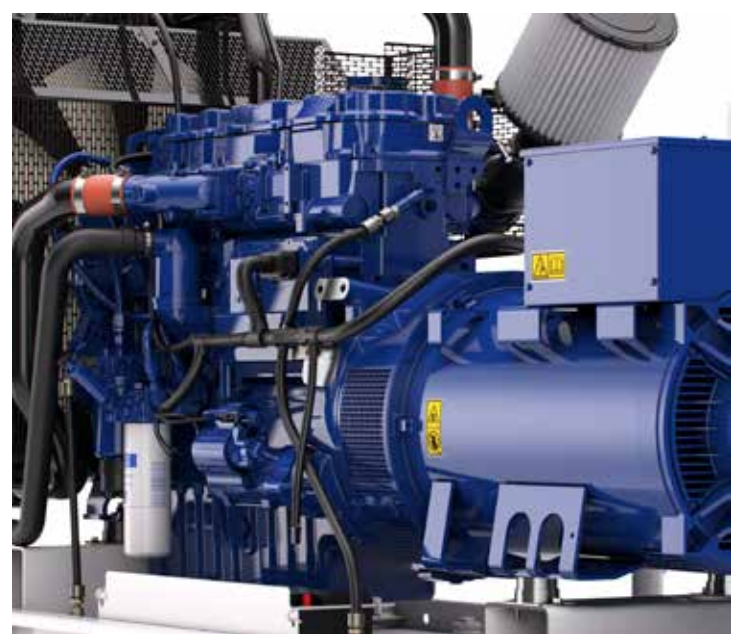
The 1500 Series Perkins engines provide reliable power suitable for a wide range of applications and markets. Combined with the Marelli & Leroy Somer alternators, providing Ingress Protection IP23 as standard, a trusted performance is guaranteed.

This new range employs the power and efficiency you come to expect from the world-renowned Perkins engines. The 225 – 375 kVA Range is designed with fuel optimisation in mind for a wide range of industry sectors including data centres, healthcare and retail.