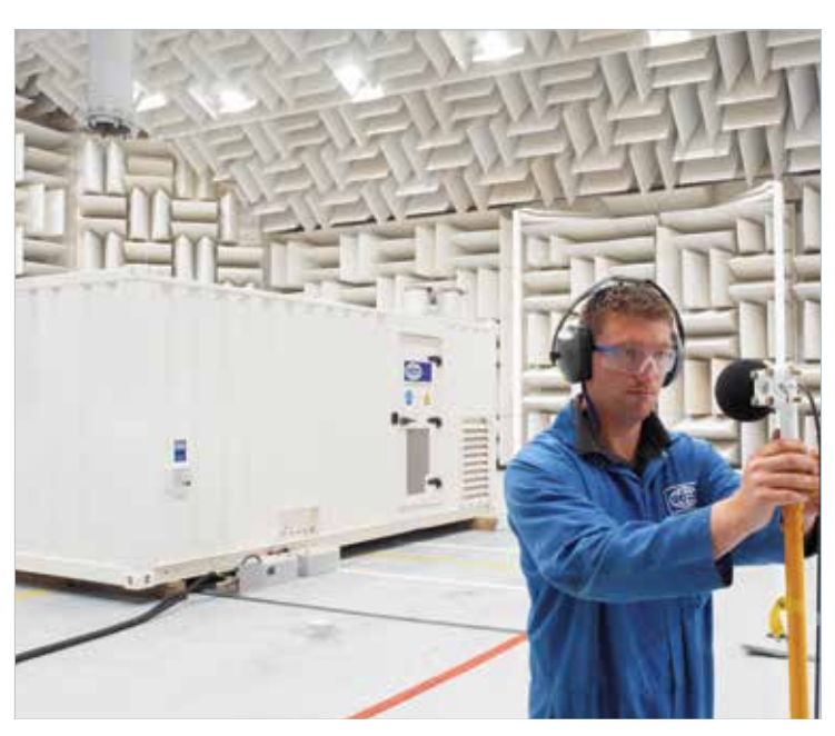
Engineering Centre of Excellence, Northern Ireland.