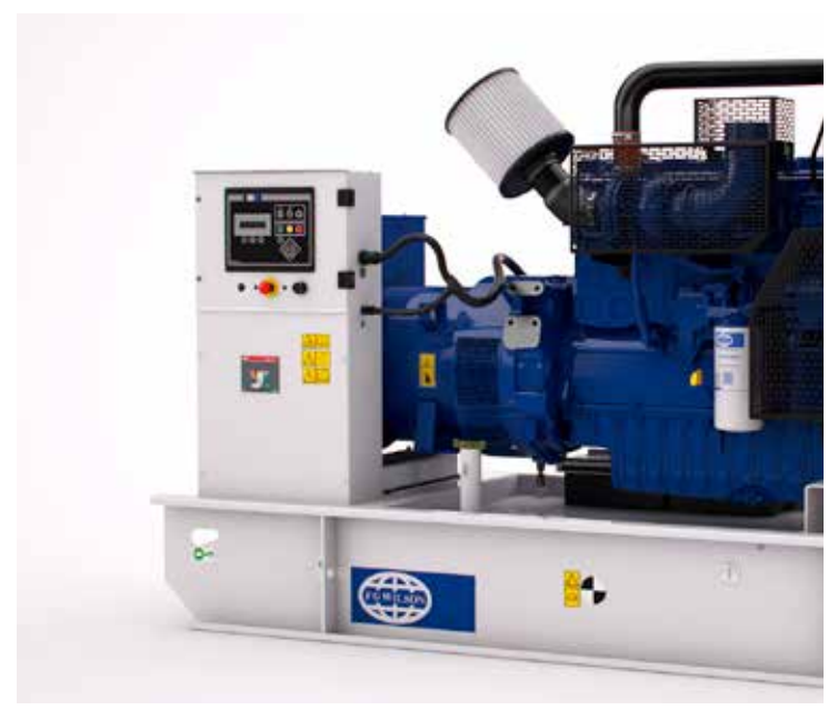
Cable access is gained directly underneath the control panel for ease of installation with the control panel tower providing full access to all components and wiring.