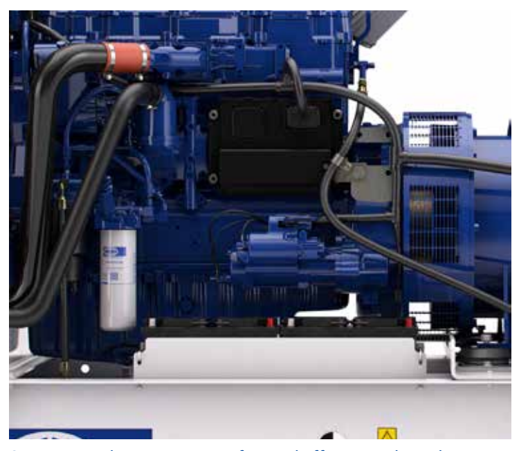
Servicing and maintenance is fast and efficient with easily accessible components. Oil and coolant drains provide convenient service accessibility while the fuel fill and gauge are positioned together for easy fill and monitoring.